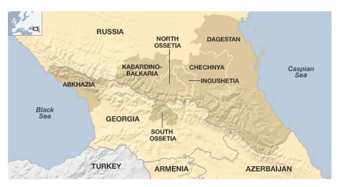
Figure 1. North Caucasus [7].

We investigate how Russia has benefited, apart from in the protection of its national integrity, in geo-energy terms, from its intervention in the internal conflict of the North Caucasus. Our hypothesis is that Russia has defended its sovereignty in a dangerous territory, particularly with "recently" separated republics in the south of the region (as shown in Figure 1). The energy significance of these republics is relatively low for the Russian energy superpower (mostly in export terms). The exception is Dagestan. Dagestan not only disposes of considerable energy reserves, it is also of vital importance due to its strategical and geopolitical situation on the Caspian Sea and its frontier with the South Caucasian countries.