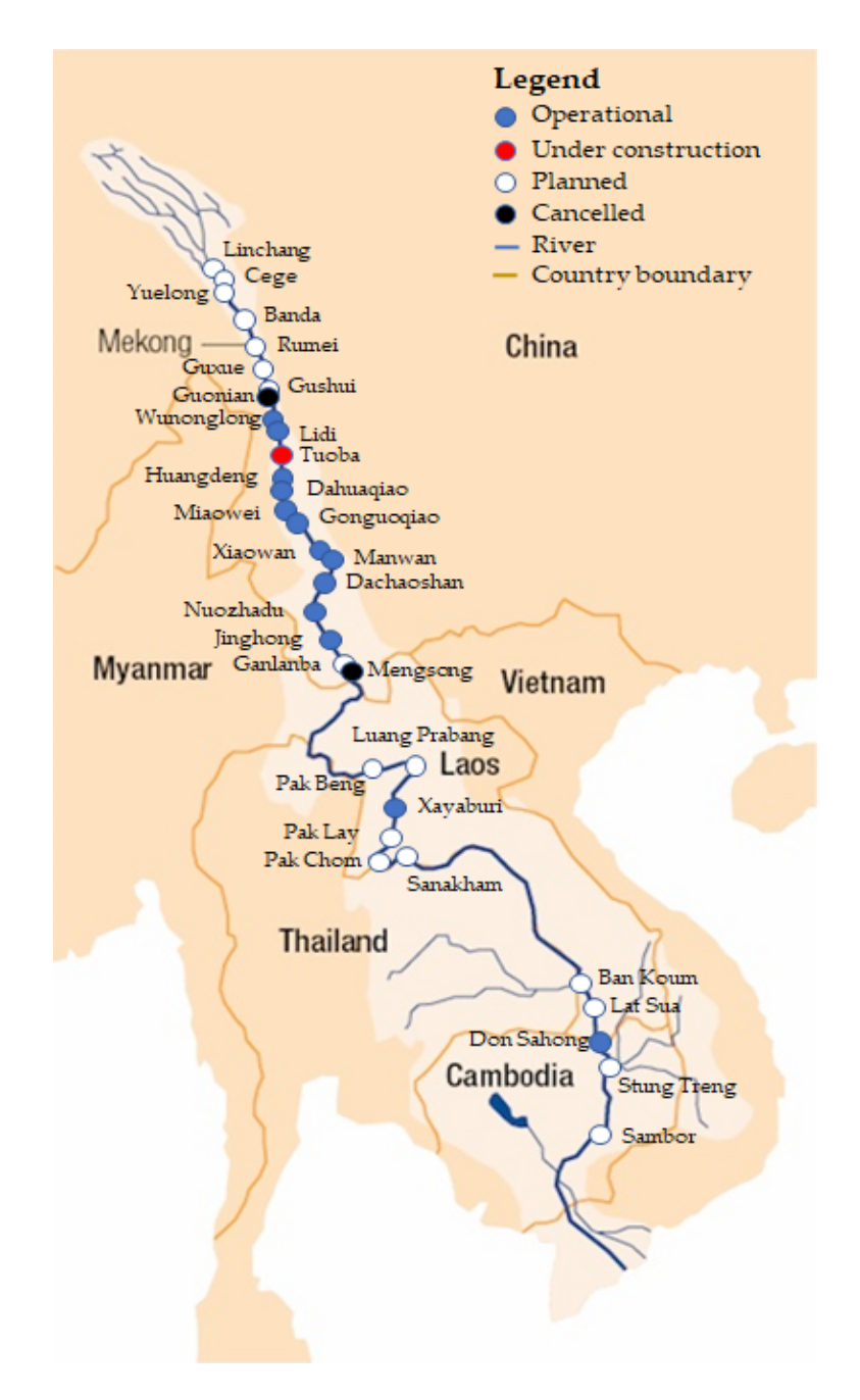
Figure 2. Current and planned hydropower dams in the Lancang-Mekong Basin [11,12,92].