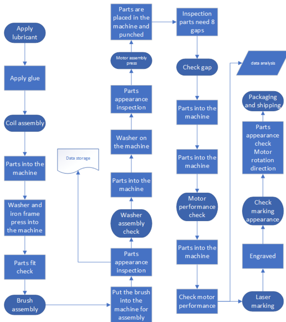
Figure 6. Motor assembly intelligent line.

things in an image faster and more efficiently than humans. It also further improves the product quality and manufacturing efficiency of the industry.