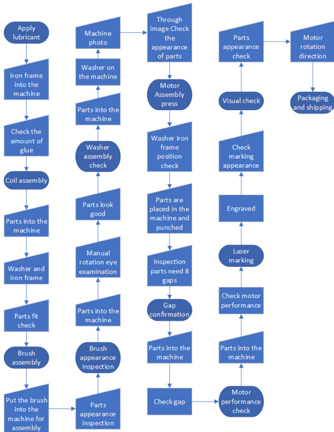
Figure 4. Motor assembly line.