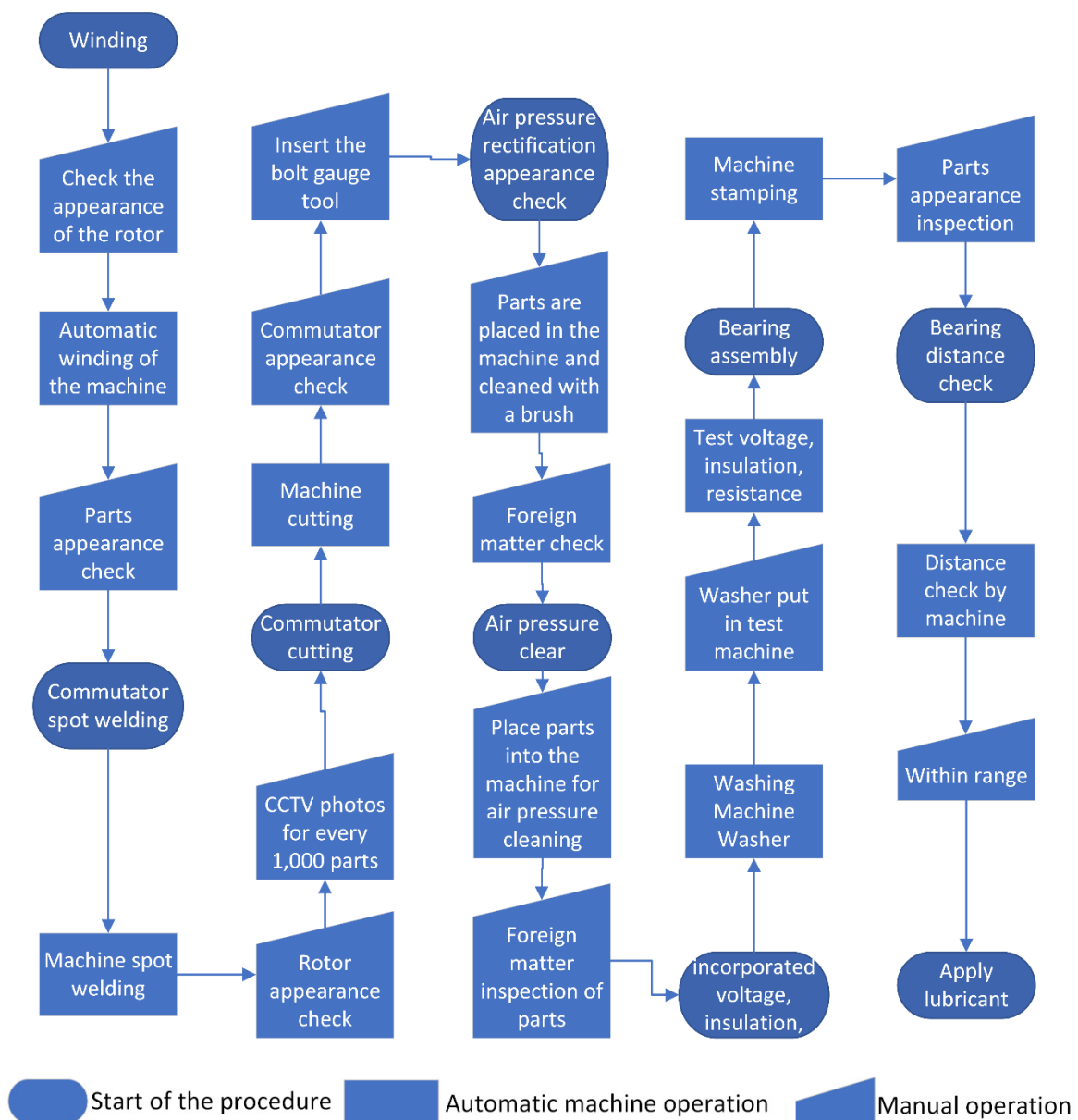
Figure 3. Coil assembly line.

The coil assembly line in Figure 3 is composed of eight main operating procedures as follows.