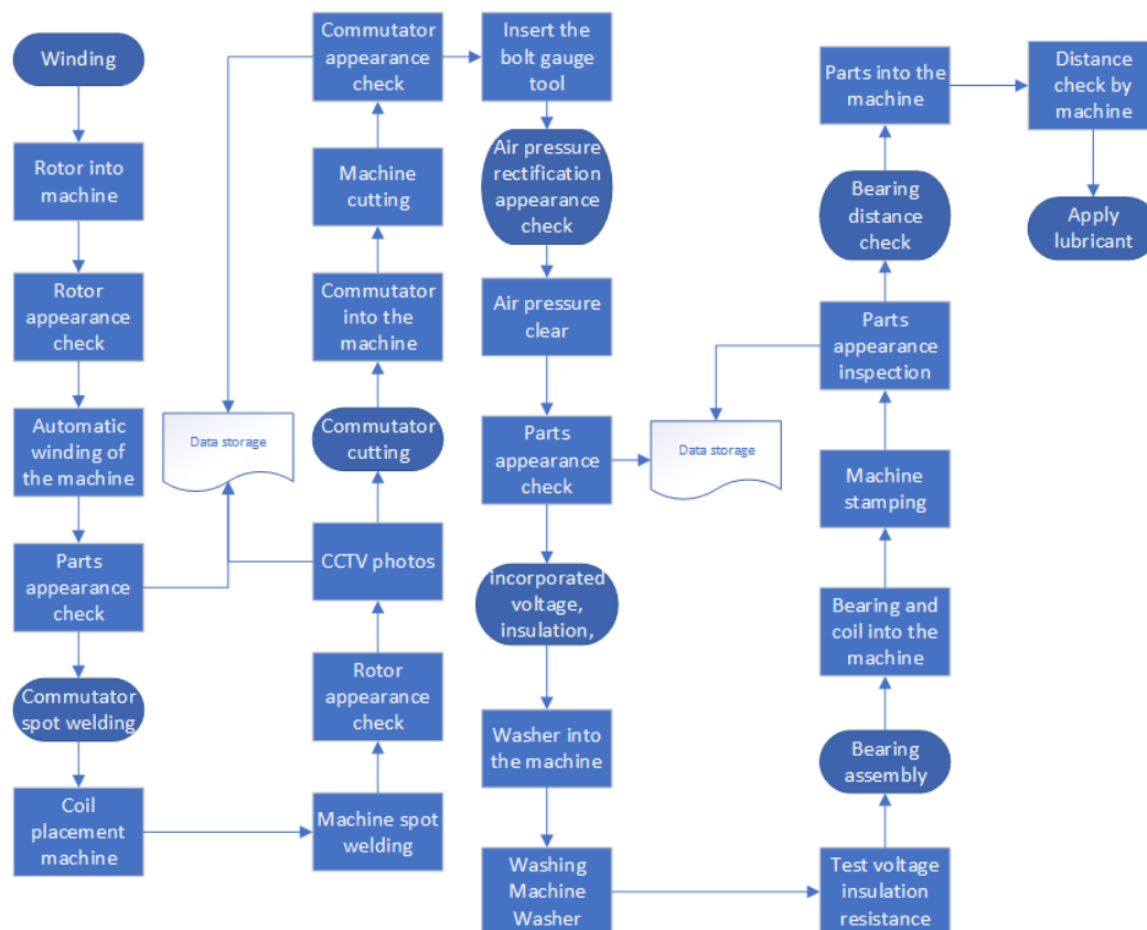
Figure 5. Coil assembly intelligent line.

operators will be reduced. The following will explain the function of the two production lines after the robot arm is introduced and replaces manpower. The process sequence is as follows. Put the rotor in the winding machine, the coil in the spot welder, the commutator in the cutting machine, the bolt gauge tool on the cut commutator, and the washer in the test machine, bearing, and coil. Put the stamping machines and bearings into the gap inspection machines. In Figure 5, the processing sequence of the part is as follows. Put the coil into the machine, the brush into the machine for assembly, the brush into the machine to assemble the washer, the motor into the machine for stamping, the motor into the gap machine, and the motor into the performance inspection machine.