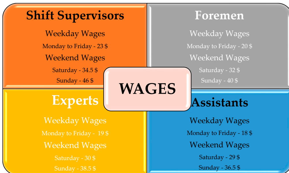
Figure 2. The wage details.

Wage details according to seniority level are shown in Figure 2.