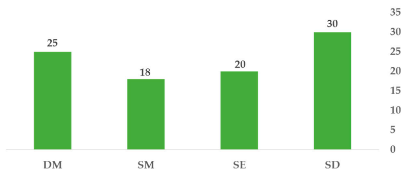
Figure 2. Antifungal activity of the extracts (sequential dichloromethane (SD) sequential ethyl acetate (SE), sequential methanolic (SM), direct methanolic (DM)) against Trichophyton mentagrophytes as the inhibition zone in agar diffusion (mm).

IZ: inhibition zone; SD: sequential dichloromethane extract; SE: sequential ethyl acetate extract; SM: sequential methanolic extract; DM: direct methanolic extract of E. divinorum ; Nys, Nystatin (100 µg/disc).