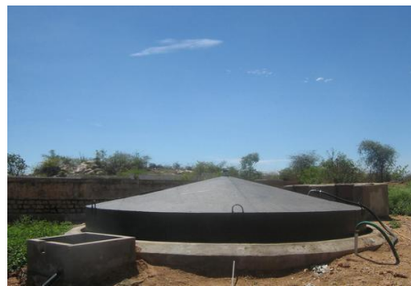
Figure 3. Typical example of a biogas supplied via flexible pipeline in India [48].

has been created through the sales of biogas to their neighbours. Typical biogas charges to rural families oscillate around 800–1000 taka (£8–£10) per month and this steady income stream ensures that pay-back of installation costs occur over a shorter period of time [28]. For example, this present research study found a singular poultry and similarly, another dairy farmer selling biogas to their neighbours via an innovative and affordable flexible pipeline. Other plant owners were observed to be selling biogas to up to six households from a singular 10 m 3 biogas plant; each household had to pay 500 taka (£5) per month for this instantaneously biogas service, thereby generating 3000 taka (£30) for the farmer. According to an estimation provided by Islam [44,45] the total cost to build a sand cement, brick made fixed dome biogas plant (Figure 3) having biogas capacity 10 m 3 (a day) is around 250,000 taka (£2400). Many biogas plants are purchased by poor rural households via loans offered by the government, banks/financial institutions or NGOs—even when generous subsidies are available [45–47].