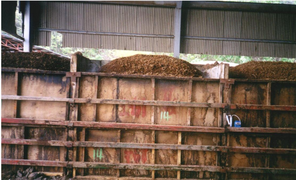
Figure 3. Collection of greenhouse gas samples at the livestock excretions composting facility adopting the stacking method.

Figure 3 shows the CO 2 /methane gas collection operation for instrumental analysis at the composting facility where livestock excretions, sawdust, and bulking agent are mixed together without any agitating operation (stacking method).