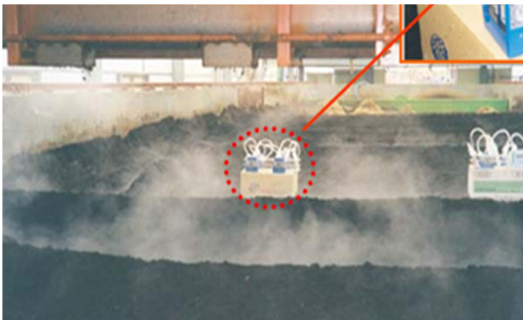
Figure 2. Collection of greenhouse gas samples at the composting facility for livestock excretions.

Figure 2 presents the CO 2 /methane gas collection operation for instrumental analysis at the composting facility using the escalator-type agitator, which mixes livestock excretions, sawdust, and bulking agent altogether.