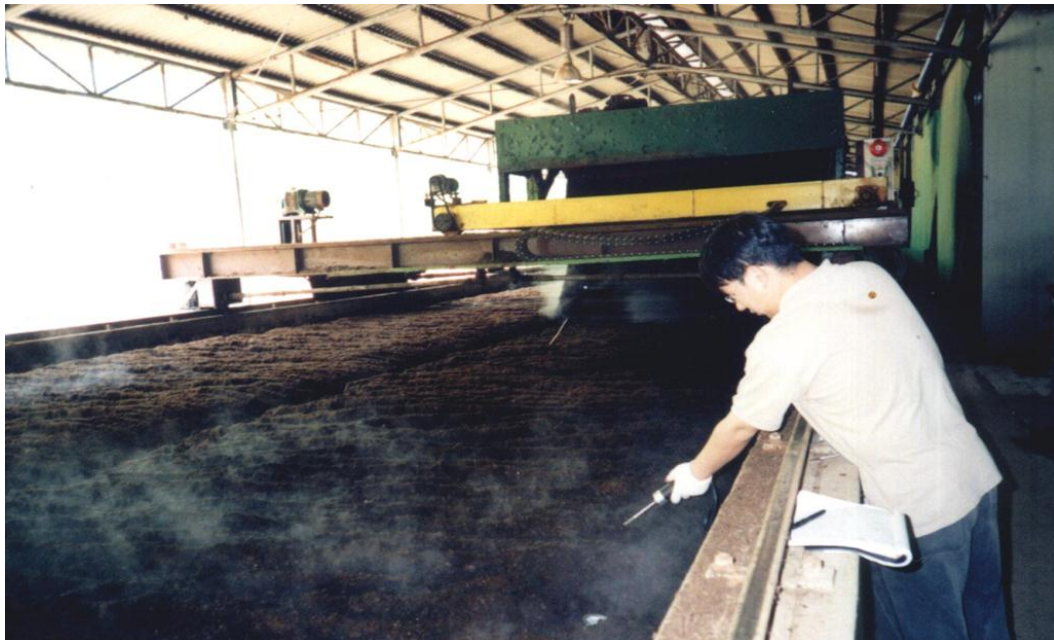
Figure 1. Measuring the greenhouse gases at the agitator-based livestock excretions composting facility adopting the direct reading method.

Figure 1 shows the method of measuring (direct measurement) the greenhouse gases CO 2 and methane through the gas detector tube at the composting (resource recovery) facility, where an escalator-type agitator mixes livestock excretions with sawdust and bulking agent.