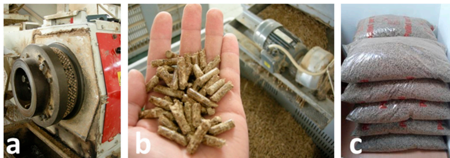
Figure 2. Schematic of the pelletization process showing (a) pellet mill; (b) olive and hazelnut pellet; and (c) packaging.

A pelletization procedure was developed and applied on bio-shredding obtained from olive and hazelnut residues (Figure 1c). Pruning residues were collected on site and immediately transferred to the laboratory for sifting and exsiccation (Figure 2) until a water content of 15% was achieved. Final water content as low as 15% is necessary for further refining of the product and pellet production. The humidity concentration in the prunings is very notable, because we can improve the technical process for pellet production by biomass. In Italy there are not many companies and total supply chains that work the prunings for pellet production and for use of these residual agriculture sub-products (Figure 3).