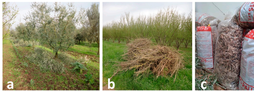
Figure 1. Pruning residues from (a) olive and (b) hazelnut after crop operations; and (c) bio-shredding.

A pelletization procedure was developed and applied on bio-shredding obtained from olive and hazelnut residues (Figure 1c). Pruning residues were collected on site and immediately transferred to the laboratory for sifting and exsiccation (Figure 2) until a water content of 15% was achieved. Final water content as low as 15% is necessary for further refining of the product and pellet production. The humidity concentration in the prunings is very notable, because we can improve the technical process for pellet production by biomass. In Italy there are not many companies and total supply chains that work the prunings for pellet production and for use of these residual agriculture sub-products (Figure 3).